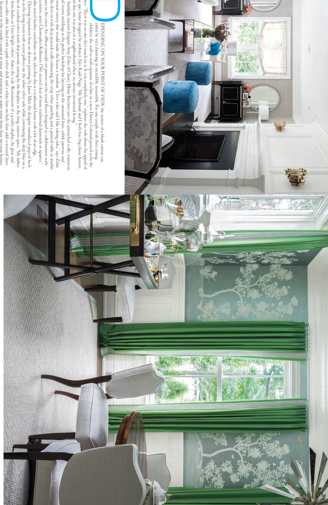
Dire in Style (exoe) Orristopher Rollinson handpainted the dring room walls with layers of silver leaf. Zolin designed the custom drapery panels with Schumacher linen. Pattern Plays (cereatin exact, room to enroul) in the living room, Fromental grassoch non the walls complements the subtle huse of Schumacher fabrics on the drapes and wood-frame chairs. The offee table is through Wakefeld Design Centre, and Calirly home Interiors designed the whet stoods. In the entry, a handpainted floor by Orristogo, Rollinson is complemented by a Highland House Hamilton table. The soft lines of the brass Circa Lighting celling facture contrast with the floor's geometry. See Resources.

In answer to the couple's request to reuse and repurpose as many items from their previous homes as possible, the designer flanked one window with their two matching wood chests and mirrors, and reupholstered a set of vintage wood-framed chairs with a chinoseric dragon fabric. It's an komic subtle Drawing inspiration from an abstract painting by Janet Mait, the designer introduced pops of fuchs an in the living room with account pillows on the white vertex ods while continuing the deep blue on a pair of crushed relever stools that provide searing by the freplace in the long narrow space. "My father is from India, so I love bright colors, shares the write. Reminiscent of a jewelry display, the glass and brass coffee table is lined with a pink velver shelf, and a white hair-on-hide chair adds a textural layer.